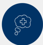
Mental Health Support