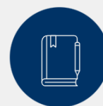
Education and Training